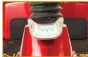
Angle adjustable LED headlight creates a wide path of bright light