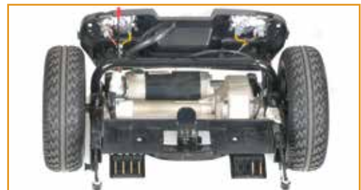
Quiet & maintenance free motor