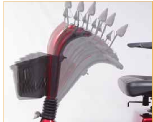
Patented infinite adjustable tiller