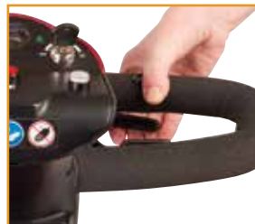
EZ Reach tiller adjustment