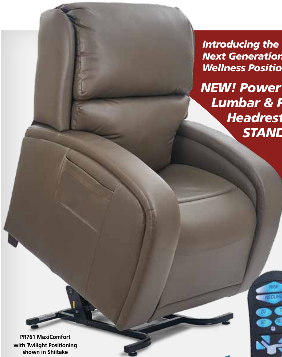
PR761 MaxiComfort with Twilight Positioning shown in Shiitake

Introducing the Next Generation of Wellness Positioning