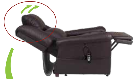
Power Articulation Head Forward