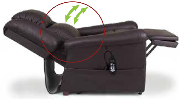
Power Adjustable Lumbar

Sizes may vary depending on fabric, filling material, upholstery and carpet thickness. All measurements taken on concrete floor using levels and metal rulers.