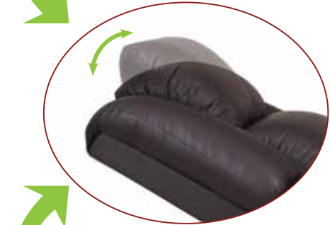
Power Articulation Head