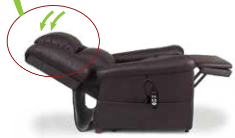
Power Articulation Head Back