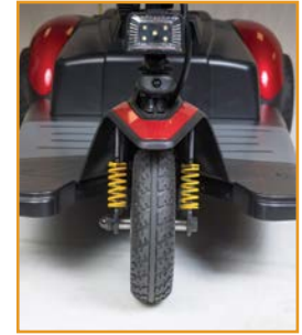
Comfort Spring System