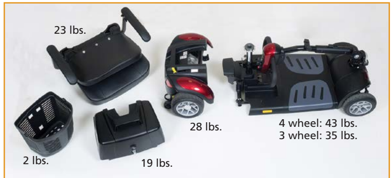
Disassembles into 5 pieces!