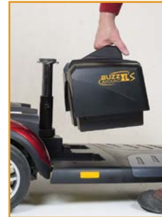
Step 2: Pull out the battery pack!