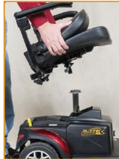
Step 1: Pop off the seat!