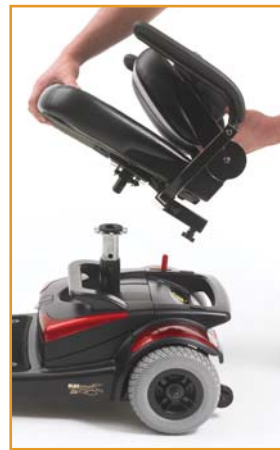
Step 1: Pop off the seat!