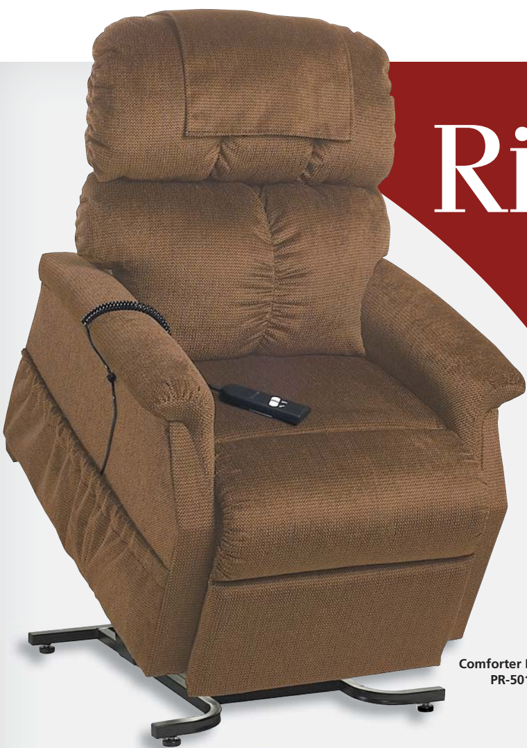
Comforter Medium PR-501M